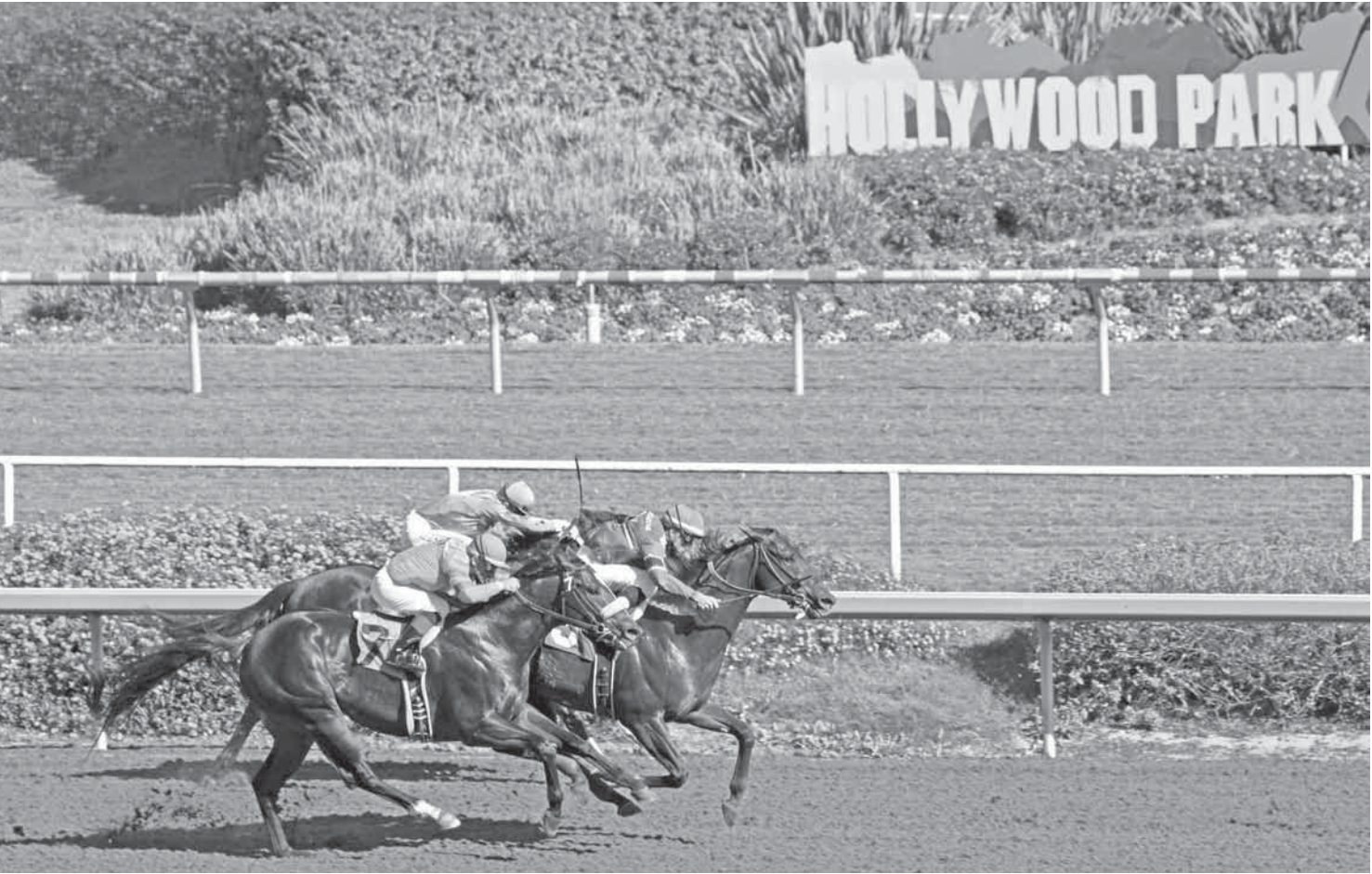
Hollywood Park closes after 75 years. Much of the track's items, including artwork and memorabilia, tractors and restaurant equipment, will be auctioned on Jan. 24-25.